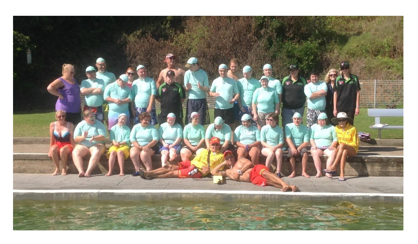
Group photo Saturday Surf Awareness participants