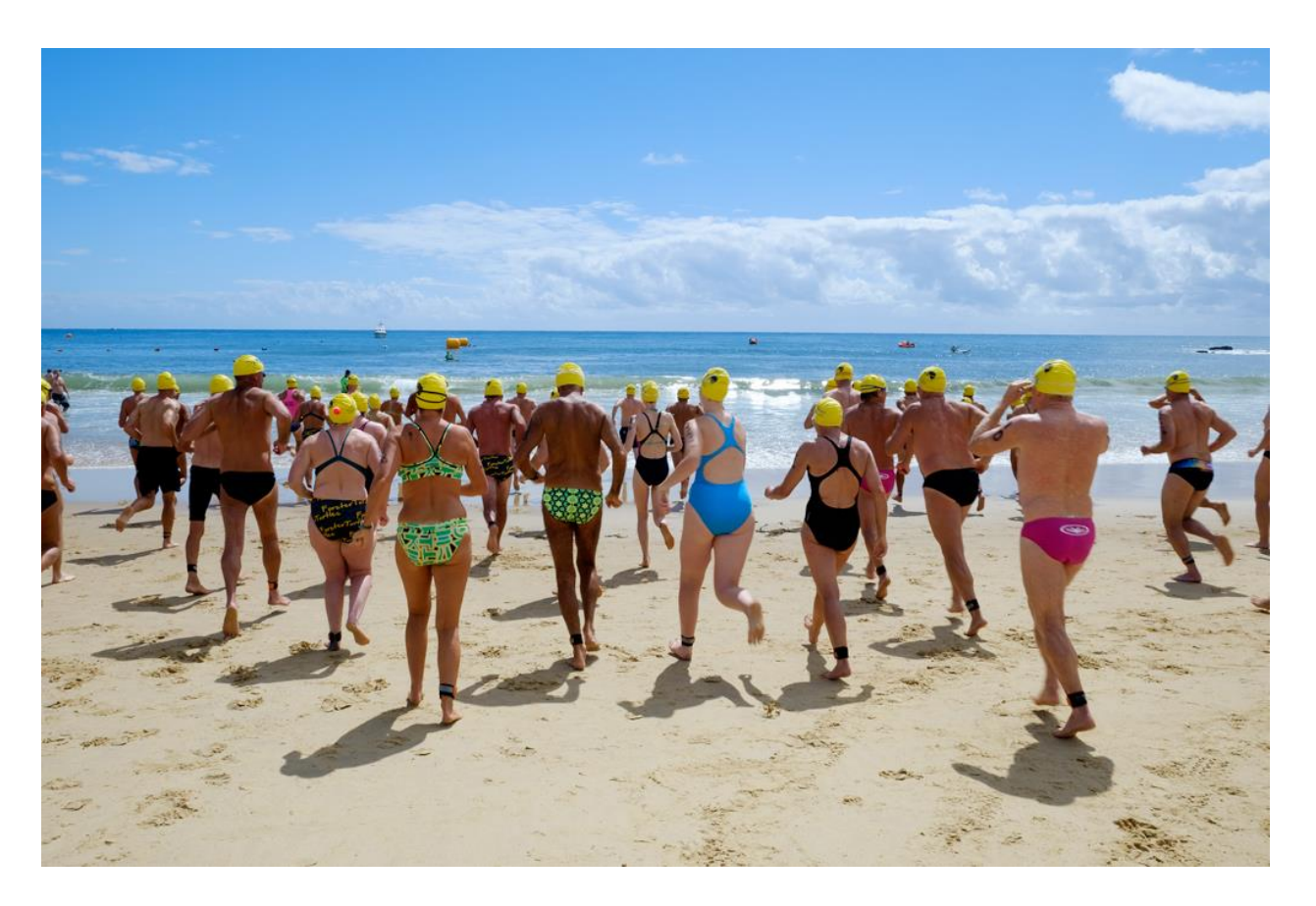
Start Head2Head Ocean Swim

The annual Head2Head held on 17 January 2016 was a huge success for the Club, with the event running smoothly, the weather turning to fabulous conditions, and participants and volunteers thoroughly enjoying the community feel of the event.