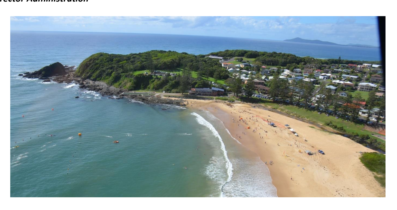
Head2Head Ocean Swim