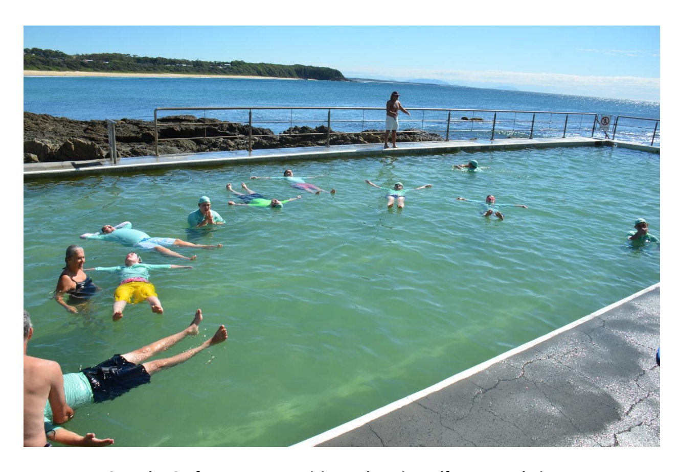
Saturday Surf Awareness participants learning self rescue techniques