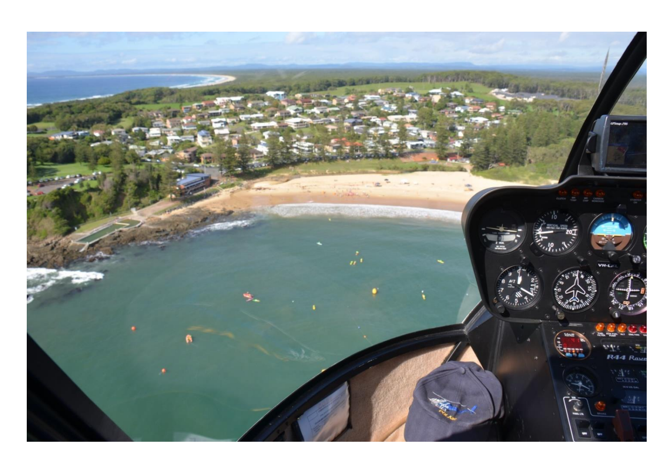
View from Grant Burley's Helicopter of Head2Head Ocean Classic