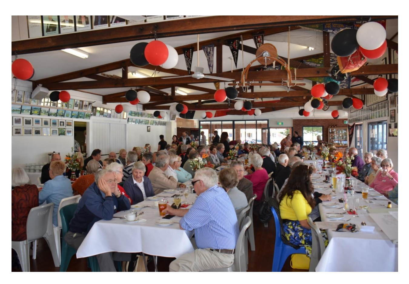
Past and present members enjoying the 90<sup>th</sup> celebrations