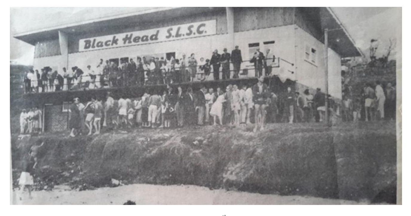
Opening of Clubhouse 4<sup>th</sup> October 1959