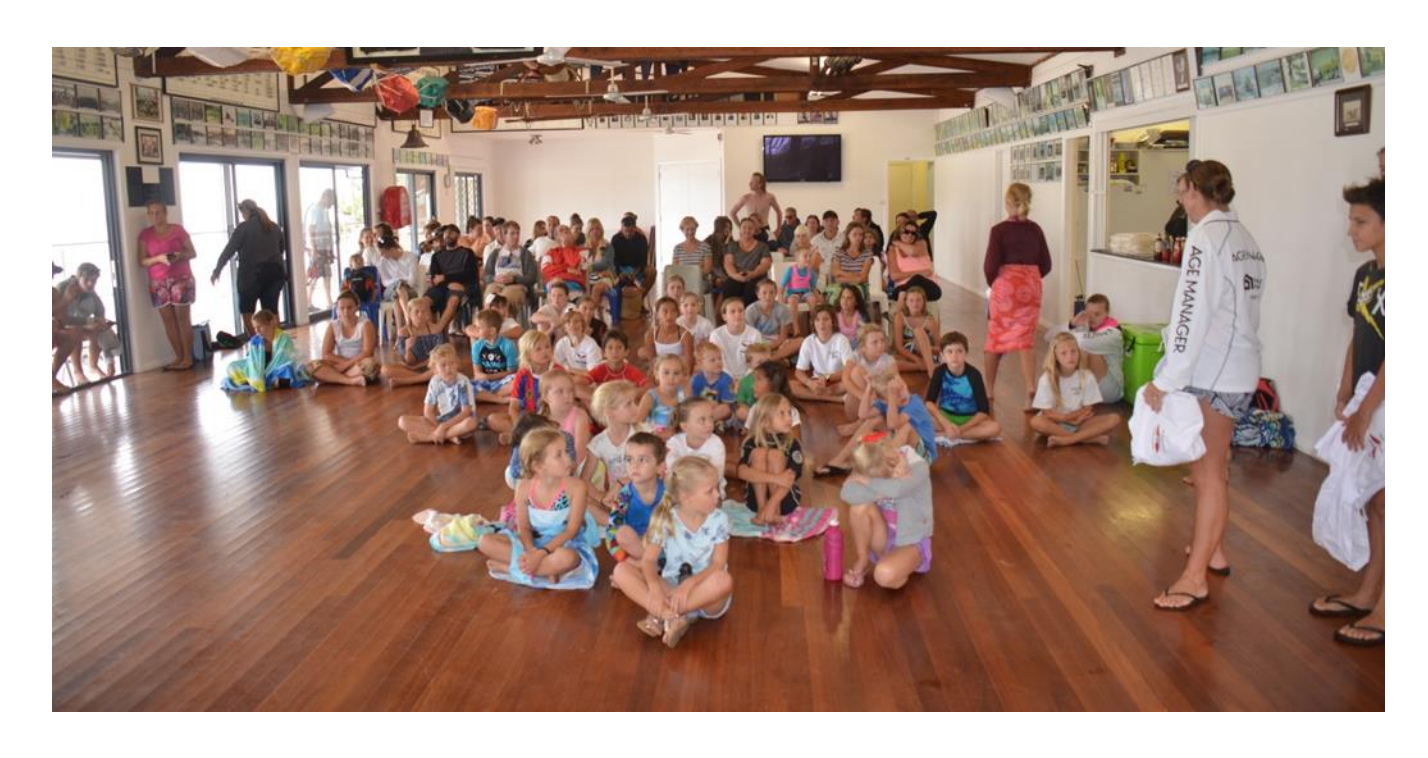
Nippers Presentation Day