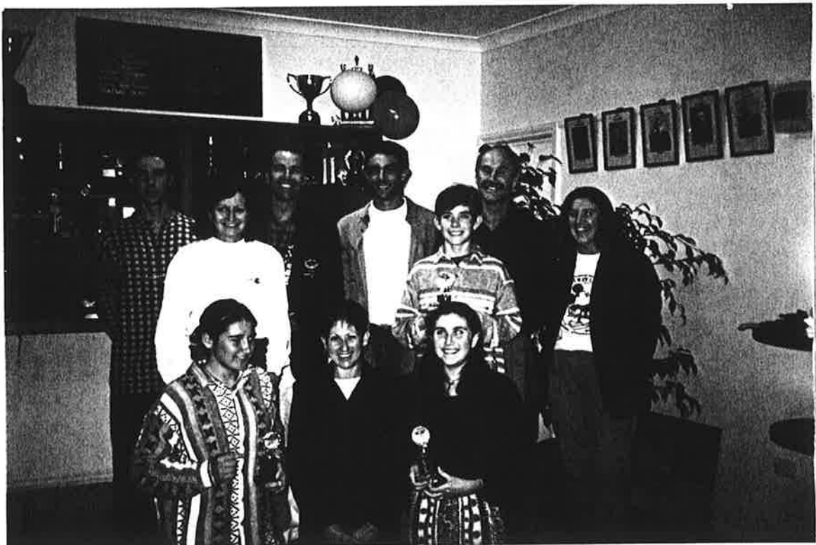
CLUB CHAMPIONS 1995-96 SEASON