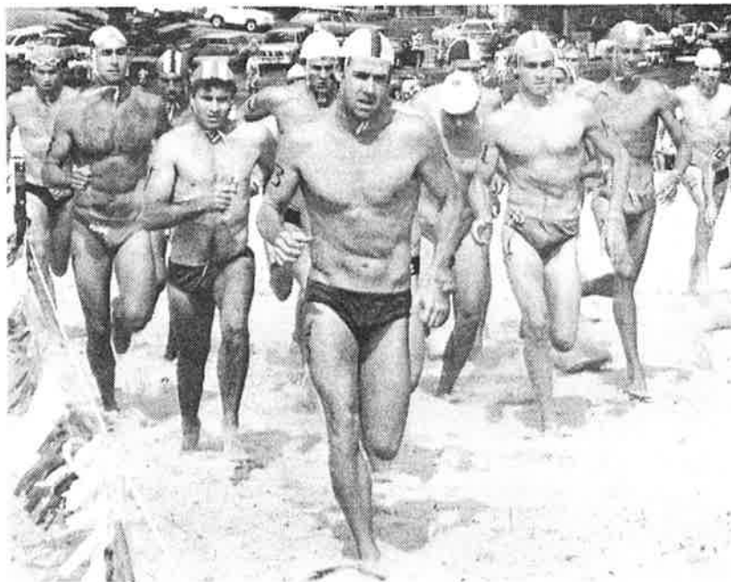
START OF THE OPEN IRONMAN